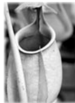
Carnivorous plant UC Davis Conservatory